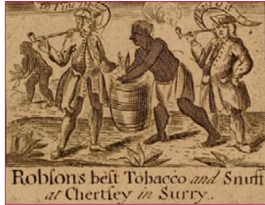
Eighteenth-century tobacco card

In 1501, shortly after Christopher Columbus discovered America, Spain and Portugal began shipping African slaves to South America to work on their plantations. In the 1600s, English colonists in Virginia began buying Africans to help grow tobacco. The first Africans who arrived at Jamestown in 1619 were probably treated as servants, freed after working for a set number of years. By the early 1700s, the Virginia Assembly had passed a set of Black Codes, or slave laws, which institutionalized life-long slavery and stipulated that offspring of a female inherited their enslaved status from their mother.