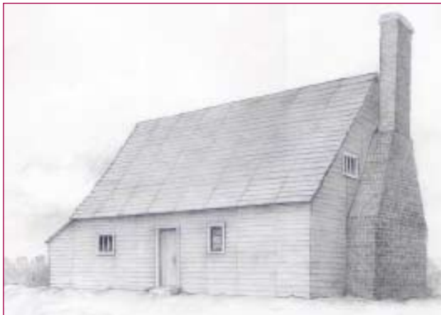
Typical wooden Virginia plantation house