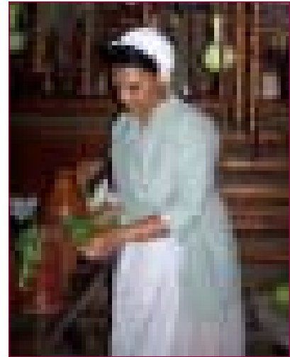
Work in the farm kitchen at the Yorktown Victory Center

Enslaved people in Virginia faced a life of great hardship. Those on smaller farms often lived in a kitchen or other outbuilding or in crude cabins near the farmer's house. On large tobacco plantations, the field slaves usually lived in cabins grouped together in the slave quarter, which was farther away from the master's house but under the watchful eye of an overseer. Although large plantations had many enslaved people, most owners usually had fewer than five, including children. Living on a small farm often made it hard for black men and women to find wives and husbands to start families. Sometimes white masters split up families and sent parents or children to different places to live and work which also made it difficult to raise a family. As a general rule, enslaved people worked from sunrise to sunset, usually in the tobacco fields. On large plantations, some learned trades and worked as blacksmiths, carpenters, and coopers or served as cooks and house servants.