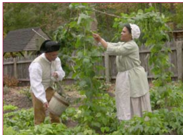
Working in the vegetable garden on re-created farm at the Yorktown Victory Center

Not all black Virginians were enslaved. From Virginia's early history, a few black people were free. By 1782, there may have been as many as 2,000 free black people living and working in Virginia. Free blacks often worked as farmers and as tradesmen, and some owned property including slaves of their own.