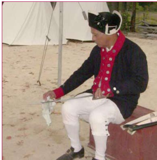
Re-created Continental Army encampment at the Yorktown Victory Center

By the time the American Revolution ended, enslaved people all over Virginia had come to realize that the patriots' talk of liberty and freedom only meant liberty and freedom for white men. A few who fought for the British ended up in colonies of freed men in Nova Scotia and Sierra Leone. Some who fought on the American side, primarily those from the northern colonies, were rewarded with their freedom. For most black Virginians, however, the hard life of slavery continued just as before the American Revolution. African Americans found out that Thomas Jefferson's famous statement in the Declaration of Independence that " all men are created equal " did not include black men. It was not until after the American Civil War that all black Virginians gained the freedom promised by the American Revolution.