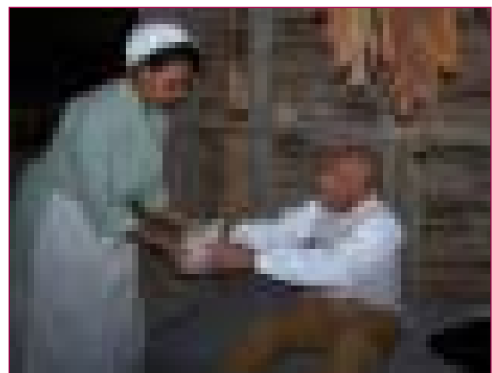
Life of enslaved persons on an 18th-century Virginia farm

Many found ways to resist the hardships of slavery. Prolonging their work, breaking or hiding tools or pretending to be sick, were safe and effective ways to resist the authority of their masters. Some enslaved people ran away to find family in other parts of the country or attempted to escape to the wilderness to begin a new life. Ads printed in the Virginia Gazette describe these runaways, and they were often captured and returned to their masters. Those who could not escape might attempt to destroy their master's crops or other property or steal food to feed their families. Such actions were usually met with harsh punishment or death.