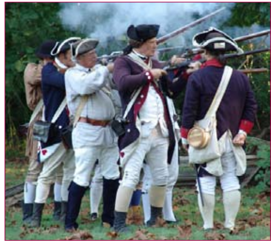
Musket firing at the Yorktown Victory Center

When the American Revolution began, black Virginians were faced with difficult choices as well as opportunities. The patriots' talk of freedom and liberty excited many black people with the chance of ending their slavery. Many enslaved people enlisted to fight on both sides of the Revolutionary War with the hopes of gaining their freedom. Virginia's Royal Governor, Lord Dunmore, offered freedom to any enslaved person owned by a patriot who would run away to fight with the British Army. Nobody knows exactly how many hundreds of enslaved Virginia men and women escaped to join the British during the war, but most of them never secured permanent freedom. Many died of smallpox; others were returned to their masters or were left behind when the British left. Many fewer blacks fought on the American side than for England. At the beginning of the war, the Continental Army, and most of the thirteen states, would not let black men serve in their units. By the end of the eight-year war though, many blacks were finally allowed to join and fight for the patriotic cause. Other blacks served as drummers, fifers, cooks, wagon drivers, and river pilots. Many hoped that their service would lead to freedom from slavery.