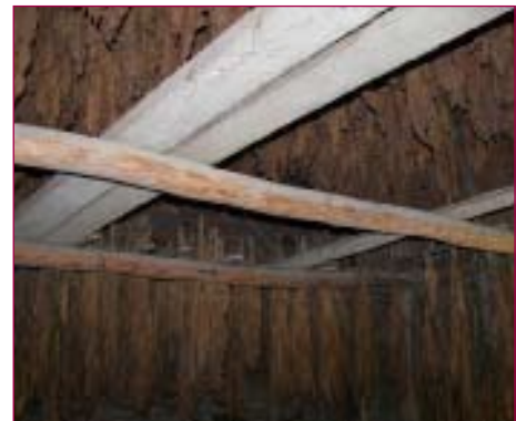
Tobacco drying in tobacco barn at the Yorktown Victory Center

The planter's main job was to raise the cash crop and manage the slaves, but those who lived on small farms performed many other jobs as well. Depending on their skills, men built and repaired buildings, fences, and simple furniture for the household. Hunting, to feed the family and to keep pests away from crops and livestock, and fishing were other important tasks undertaken by most farmers. Items not produced on the farm were purchased from local merchants or imported from England. Sometimes the planter paid cash for these goods, but he usually bought on credit and paid off his account when he sold his next crop of tobacco or wheat.