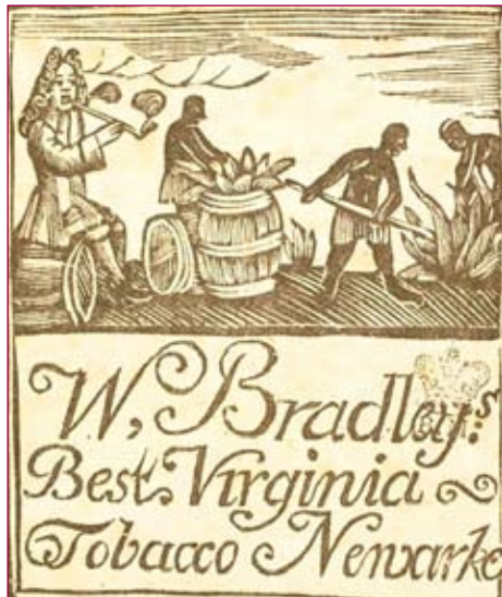
Eighteenth-century tobacco card

At the end of the workday and on Sundays and Christmas, most enslaved people had a few hours to tend to personal needs. They often spent this time doing their own household chores or working in their own gardens. Many masters allowed their slaves to raise chickens, vegetables and tobacco during their spare time, and sometimes they were allowed to sell these things to earn a small amount of money. When they could, slaves spent their evenings and limited free time visiting friends or family who might live nearby, telling stories, singing, and dancing. Many of these activities combined familiar African traditions with British customs learned in the New World. Some of the slaves' dances were similar to their African tribal dances, and their songs often told stories about how their masters treated them and the injustices of slavery. Some musical instruments used by enslaved people were similar to those used in Africa. The banjo, made out of a hollow gourd, and the drum were two instruments that slaves made and used to create music.