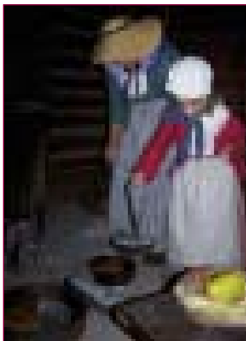
Hearth cooking in the farm kitchen at the Yorktown Victory Center

Children's chores and education varied, depending on whether they were boys or girls. Very young children were under their mother's care. Public schools were not available in colonial Virginia, so children often learned everything they needed to know at home. Some boys received limited schooling from their local Anglican minister. Formal education was usually only considered for boys because they were expected to learn how to run the farm, make purchases, deal with finances, and manage slaves. If his parents were literate, a young boy might be taught reading, writing and arithmetic at home. Most young girls learned to cook, spin, and sew from their mothers, and they might have learned to write their names and read the Bible. Some children used a hornbook to learn their letters. A hornbook was a primer with the letters of the alphabet, mounted on wood, bone, or leather and often protected by a thin sheet of transparent horn. Few Virginians could afford to own many books; many owned only a Bible. Children's books, which were available to the