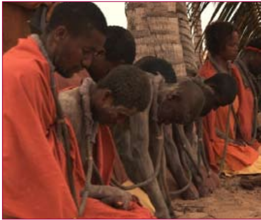
Preparing to leave African shores - photo from 1607: A Nation Takes Root

Africans who arrived as slaves had already suffered many terrible months before reaching Virginia. Most lived in tribal villages in western Africa before they were captured in wars or kidnapped by other Africans who traded slaves. The captives were tied together in long human chains called coffles and forced to walk many miles to a trading fort on the sea coast. They were then sold to white slave merchants who packed them into large slave ships that carried them across the ocean to America. The voyage across the Atlantic Ocean was called the middle passage and was one of