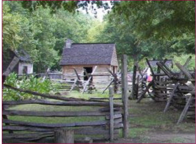
Re-created 18th-century farm at the Yorktown Victory Center

In 1775, over two million people lived in the thirteen American colonies and about 500,000 of them lived in Virginia, the largest and most populous colony. Many of these people were farmers or planters who lived and worked on small farms of less than two hundred acres. A relatively small number of Virginians were wealthy planters or merchants, and only about two percent of the population lived in Virginia's few small towns or cities like York, Norfolk, Richmond, Williamsburg, or Fredericksburg. About 200,000 of the people living in Virginia were enslaved African Americans most of whom worked in tobacco fields for white masters.