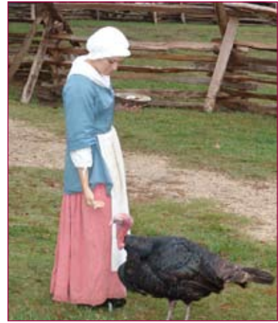
Feeding a turkey on the farm at the Yorktown Victory Center

Animals served many uses on Virginia farms. Oxen and horses were strong work animals that could be used to pull carts and wagons, plow the fields, and carry tobacco from the farm to the tobacco inspection warehouse. Farmers also raised pigs, cows, chickens and other fowl for food. Pigs were slaughtered for meat, lard, or soap for the farm. Sheep were raised for wool which could be spun into yarn and then knitted or woven into cloth. Beef was a popular food on Virginia farms, and cows produced milk for both butter and cheese. Chickens, geese, guinea fowl, and turkeys provided eggs, meat, and feathers. Deer, wild fowl, and other game were hunted to supplement the family diet.