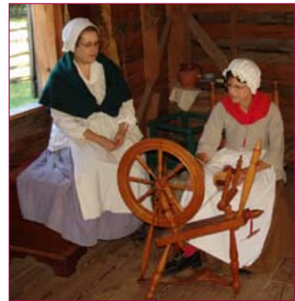
Women spinning on the farm at the Yorktown Victory Center

The busy life of women on Virginia farms fit into the seasonal cycles and the growing season of the cash crop as well. In the