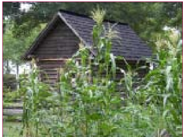
Corn growing on the farm at the Yorktown Victory Center

In addition to growing a primary cash crop, farmers also grew a variety of other things. Virginia farmers raised vegetables like corn, beans, peas, carrots, and cabbage to eat. Corn was an important crop because it provided food for humans – eaten fresh or ground into corn meal flour – and food for farm animals; and the husks could be used for fodder, to make mats, or to stuff into mattresses. Farm women also raised a variety of herbs such as parsley, rosemary, lavender, chamomile, and spearmint to season food and for medicinal purposes.