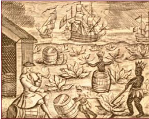
Eighteenth-century tobacco card

To earn a living, planters grew some type of cash crop that could be sold for money or credit in order to buy needed tools, livestock, and household goods which could not be produced on the farm. Before the American Revolution, tobacco was the crop most Virginians grew and sold to English and Scottish merchants. Toward the end of the eighteenth century, however, many farmers began growing grains like wheat, oats and corn. These crops took fewer workers to grow, did not deplete the nutrients in the soil the way tobacco did, and were in great demand in Europe and the West Indies. Although many Virginians began growing these grains, tobacco continued to be the colony's largest export crop.