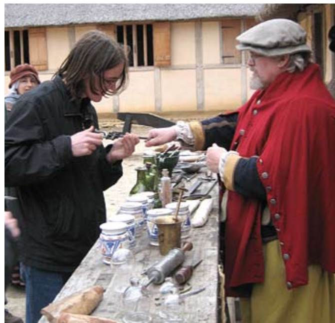
A visitor learns how a terebellum is used for extracting bullets. Shown in the foreground are sassafras root, used to reduce fever, and examples of cupping glasses that, with the interiors heated, were applied to abscesses or to stimulate circulation for the common practice of bloodletting.