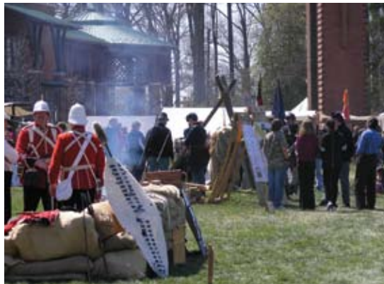
Re-enactment groups depicting centuries of military history will gather at Jamestown Settlement for "Military Through the Ages" March 20 and 21.

The popular annual event "Military Through the Ages," with re-enactment groups spanning the centuries, will take