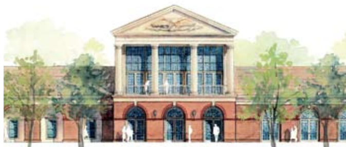
The two-story main entrance of the planned new Yorktown Victory Center will directly face the roadway entrance to the museum. Preliminary architectural design work is complete.

The Robins Foundation grant will be used for general support of the project. The Altria grant will go toward building the museum collection, and the Dominion grant supports research and planning for a new introductory film. ■