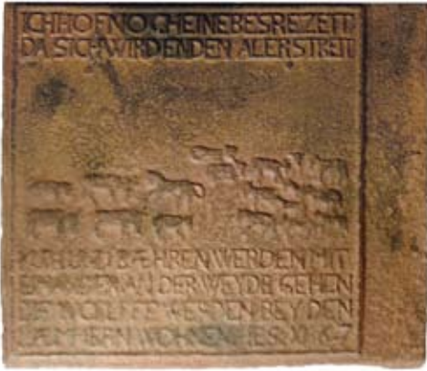
A cast-iron stove plate produced about 1773 at Marlboro Furnace in Virginia's upper Shenandoah Valley is illustrated with verses in German. This area attracted large numbers of Germans from Pennsylvania. The stove plate is exhibited in "The Legacy of Yorktown: Virginia Beckons" at the Yorktown Victory Center.

By contrast with its neighboring region, the Lower South (South Carolina and Georgia) contained less than 10 percent of the colonies' population. However, African and African-American slaves comprised more than half of the region's people. English, Scotch-Irish and Irish immigrants from Barbados settled the coast, hoping to grow exotic crops such as sugar cane, cotton and citrus fruits, but rice, indigo and naval stores soon dominated the economy. Inland, settlers cut timber and raised corn, cattle and hogs.