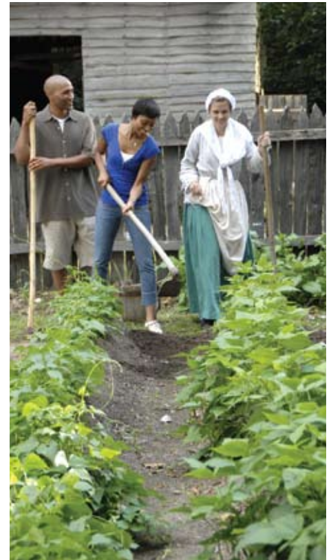
Implements used in colonial Virginia for farming, fishing, hunting, defense, navigation and building will be the focus of interpretive programs and hands-on activities at Jamestown Settlement and the Yorktown Victory Center during the "Tools of the Trade" theme month in June.

During three months, interpretive programs will focus on themes: "From Africa to Virginia" at Jamestown Settlement in February and, at both museums, "Tools of the Trade" in June and "Pastimes of Colonial Virginia" in August. ■