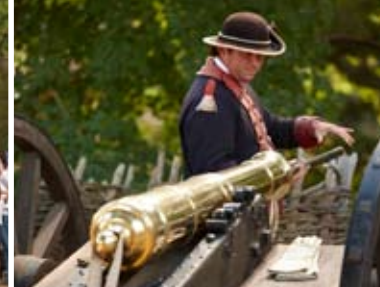
YORKTOWN VICTORY CENTER